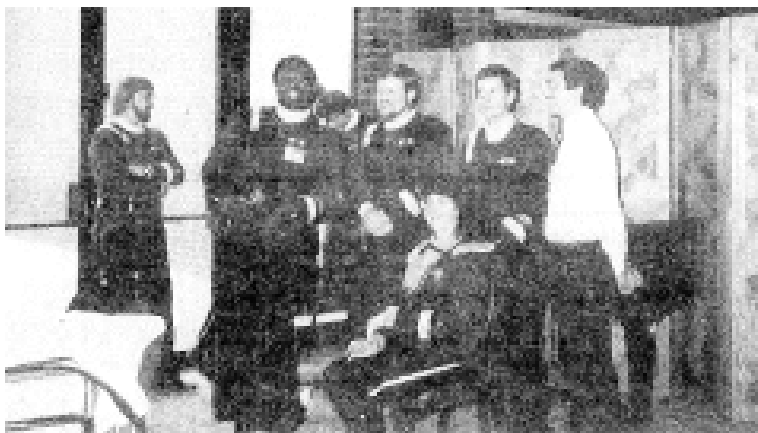
FLEET FUN AT SHORE LEAVE (JULY'87)