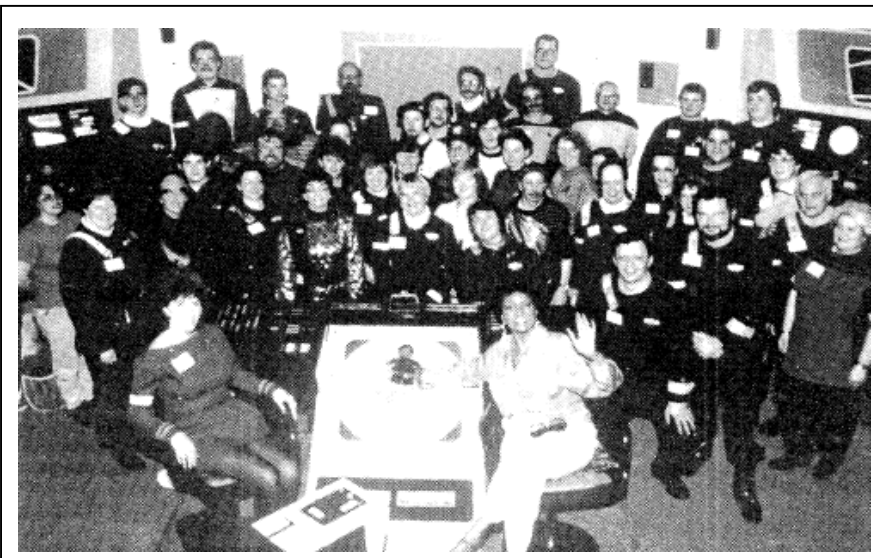
The crew of the USS Kasimar with Nichelle Nichols aboard an original Enterprise replica, the pride and joy of the crew.

"I never met a chocolate I didn't like," Troi states. "It's not just a matter of taste; it's the whole experience". She then explains how to eat it. "First of all, you have to spoon the fudge around the rim, leaving only the ice cream in the middle. Then, you gently spoon the ice cream around the sides like you're sculpting it. Relish every bite. Make every