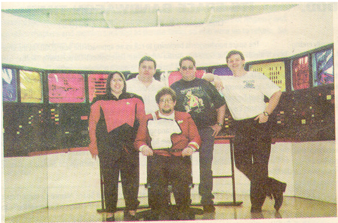
Members of the USS Star Empire recruit at a mall using a bridge set on loan from the USS Oklahoma.

The center spread of each issue will be a photo essay of the fleet. At press time, we did not have a large number of photos available to us. Send in those pictures! Check page 2 for the mailing address.