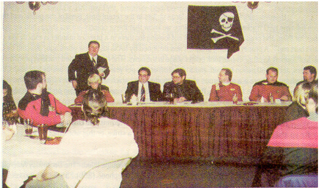
The list of dignitaries is announced at the USS Star Empire's 10th anniversary party.