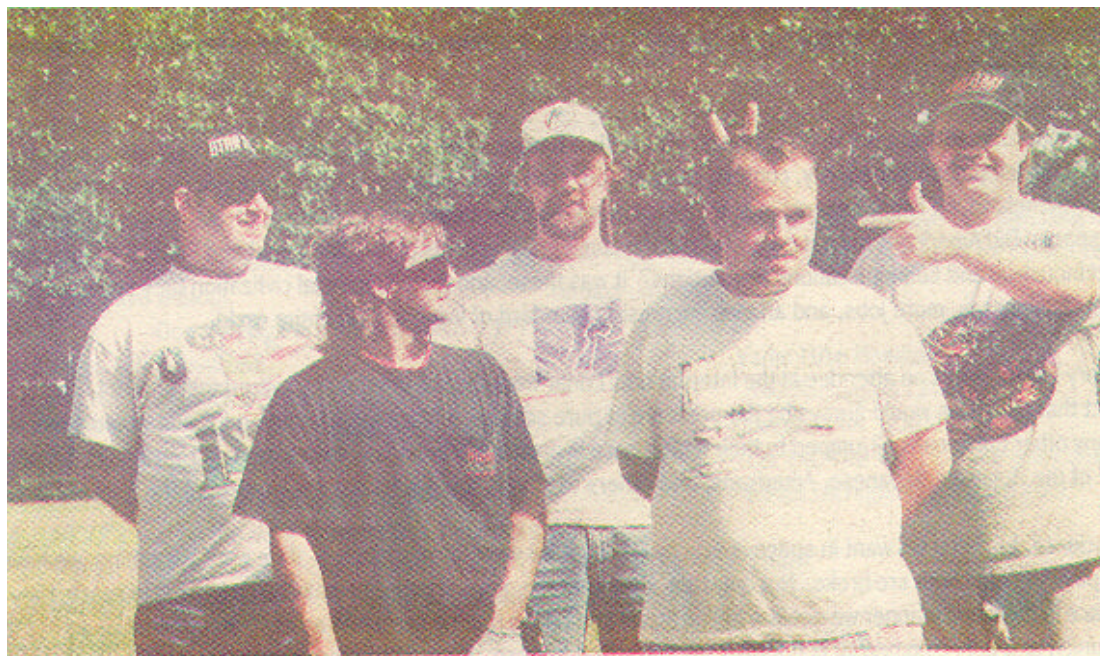
Crew members of the Shuttle Darkseed after too much sun in the park.