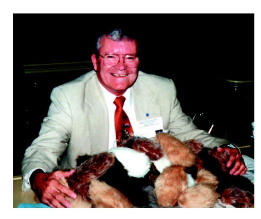
Fred Haise poses with some tribbles....guaranteed "neutered" by the crew of the Haise