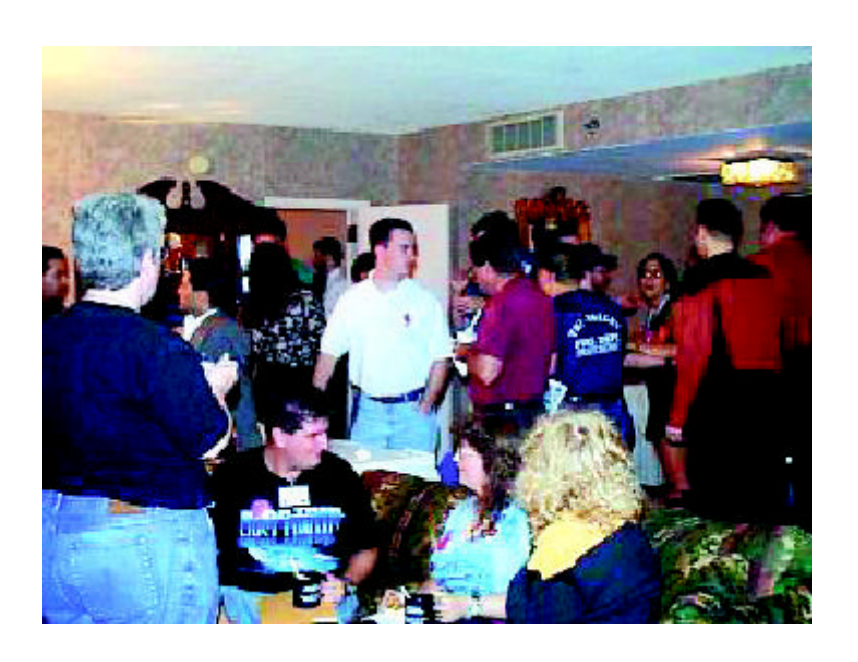
IC Attendees mix and mingle at the Friday night Italian Ice Social