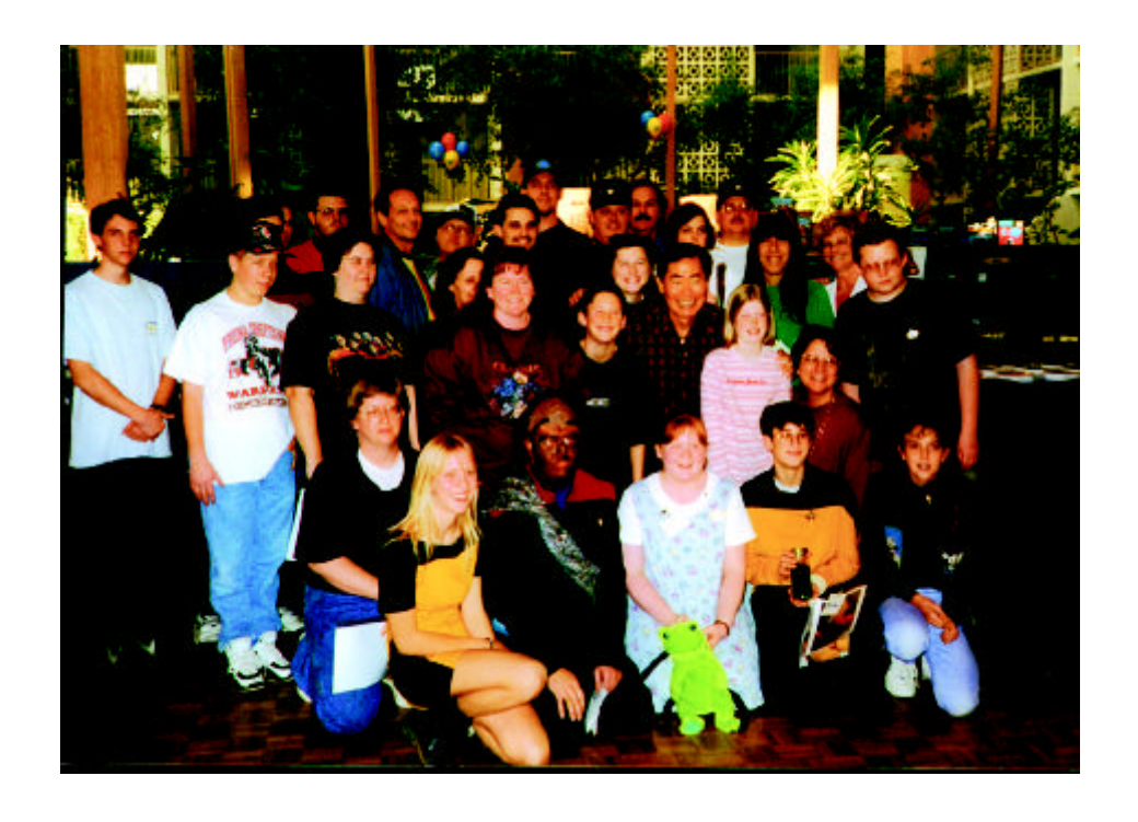
The crew of the USS Palo Duro pose with George Takei