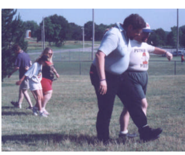
Three-legged race at Spring fling '98