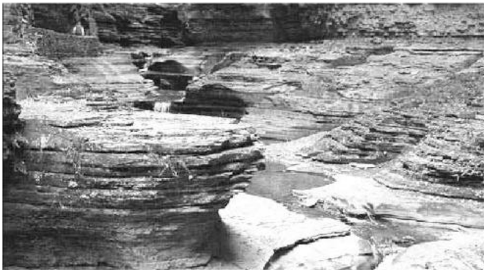
Beautiful view of a scenic portion of the gorge (notice size of people in top left corner of picture - this place is BIG!)