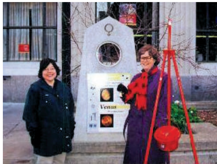
As Accord's crew approached the center of the Solar System, we ran into these natives of Venus. Apparently, residents of this planet spend the month of December ringing a bell in front of a curious red kettle.

Dr. Sagan, the noted astronomer who brought astronomy to the masses through the PBS television program "Cosmos," was a professor at Ithaca's Cornell University.