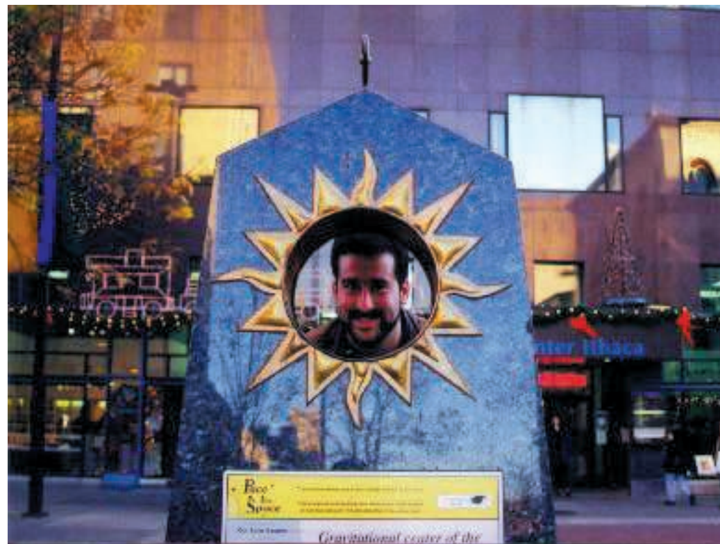
Why do starship commanding officers sometimes seem to think they're at the center of the universe? This one just happens to be at the center of the solar system.

For more information about the Carl Sagan Planet Walk or the Sciencenter, visit the web site at http://www.sciencenter.org/