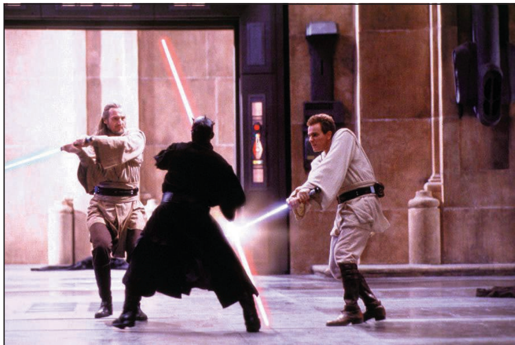
Jedi Masters Qui-Gon Jinn (Liam Neeson, at left) and the young Obi-Wan Kenobi (Ewan McGregor, at right) fight Darth Maul (Ray Park), the newest villain in the Star Wars saga.