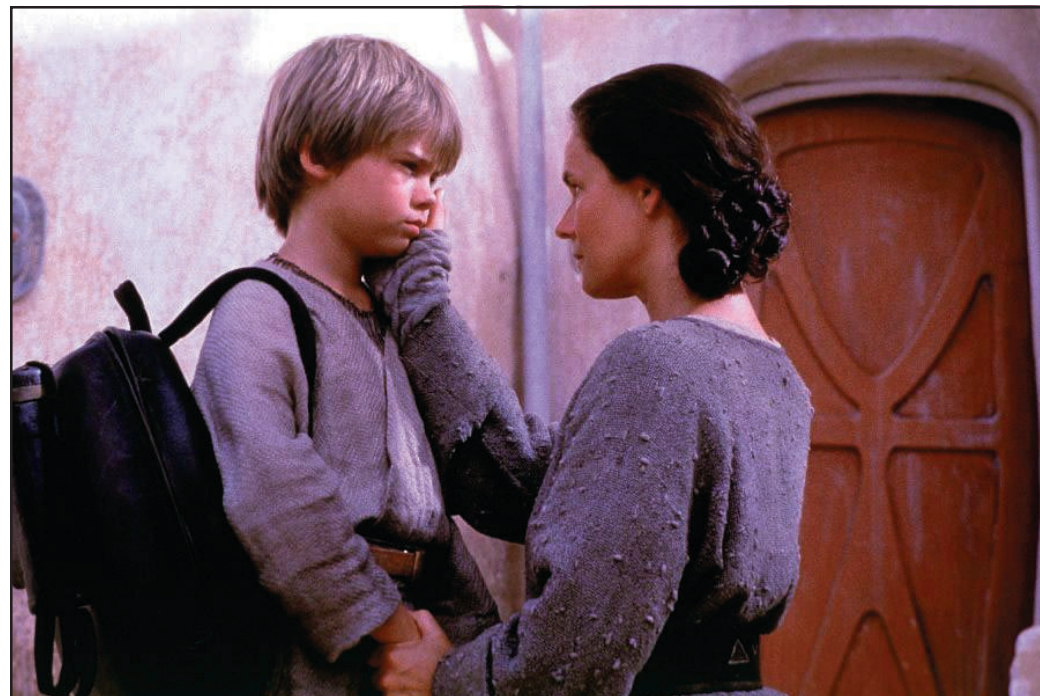
Jake Lloyd is the adorable young Anakin Skywalker, who most moviegoers know is the future Darth Vader. Like most adorable little kids, he's a little shy about attention from mom (Pernilla August).

"This has very little plot." Hmm, let's think about this for a second. Wasn't the plot already established in episodes 4-6? Does the dictionary definition of prequel need to be re-referenced? If that's too much to handle, then, let's think about the movie itself, and think: "Simplicity...Bad tries to conquer