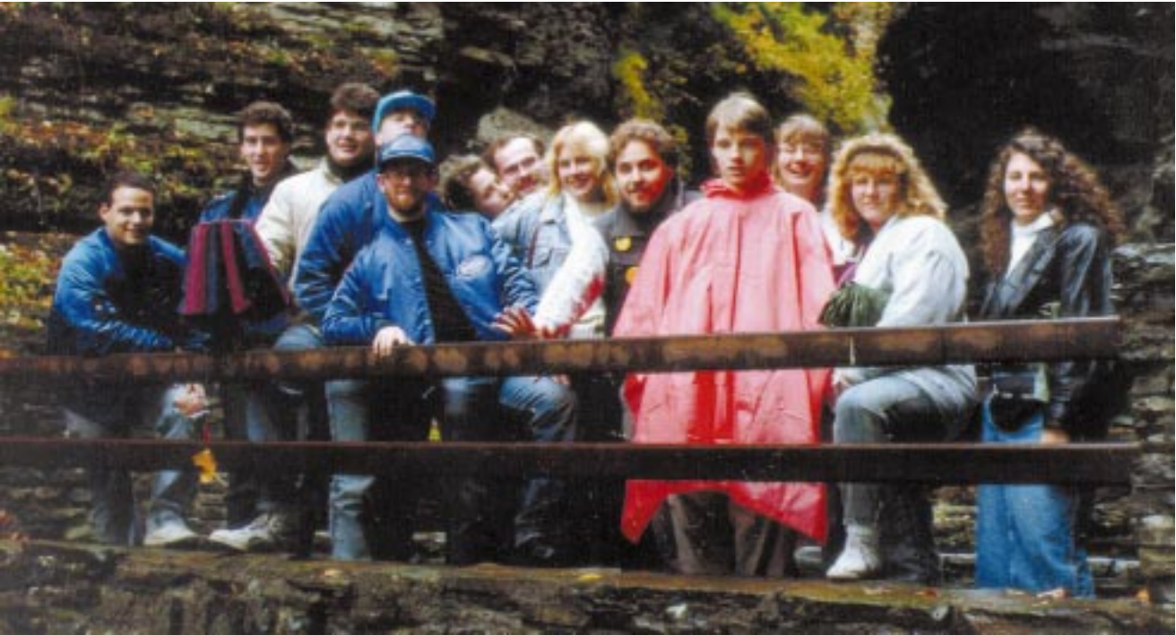
1991: The second annual Watkins Glen weekend was attended by 14 members of the U.S.S Avenger. How times have changed!