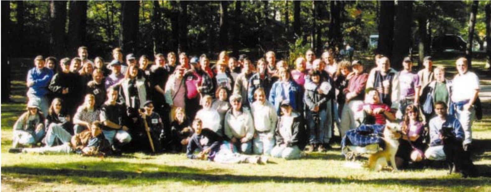
1999: The tenth annual Watkins Glen weekend saw 84 humans and 3 canines take the awe-inspiring trek up the gorge on a beautiful autumn day.