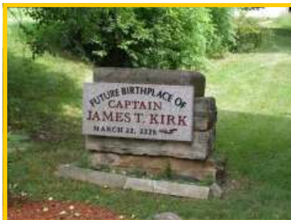
The birthstone of James T. Kirk