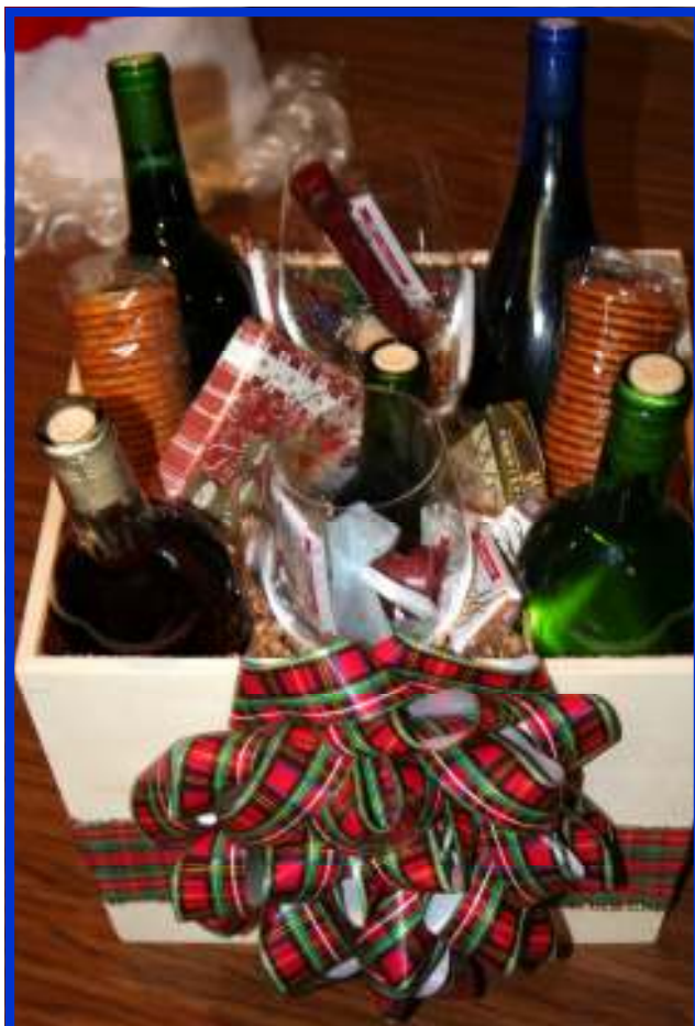
USS Niagara basket of Holiday Cheer