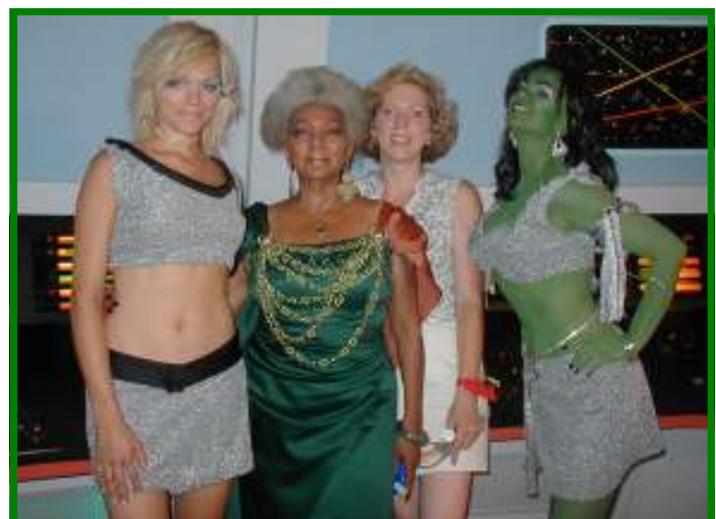
Ladies of ST: Of Gods And Men