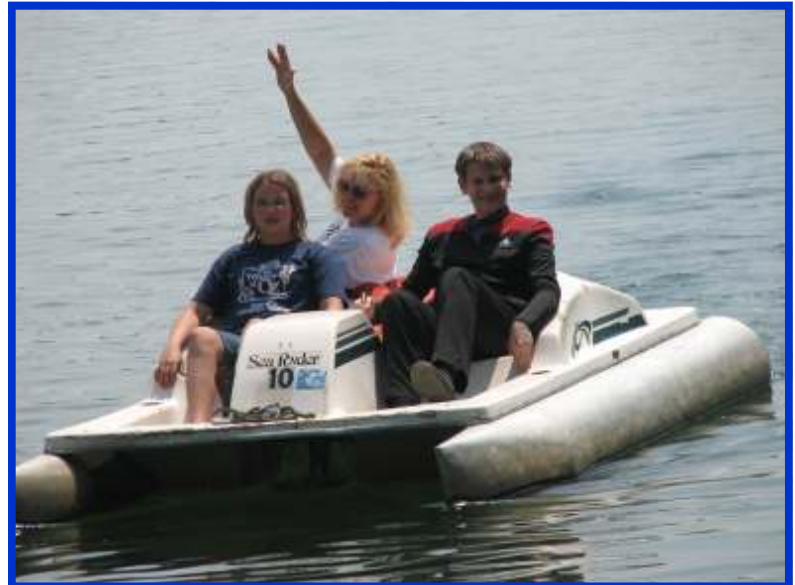
Ahoy from the USS Alaric