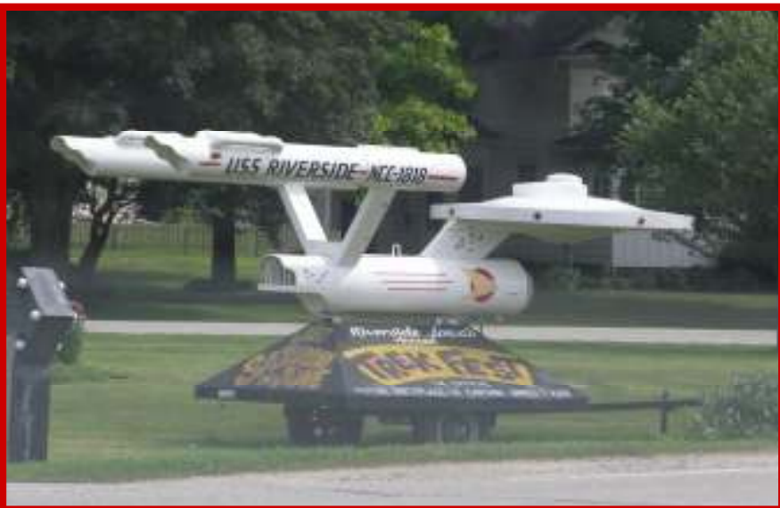
Riverside town float as it sits in the town's park on main street

It is preferred that all pictures be submitted via e-mail as attachment files in a .jpg or gif. format with a 300 DPI resolution, if possible. Postal mail picture submissions MUST be postmarked by the submission due date or will be considered for future issues.