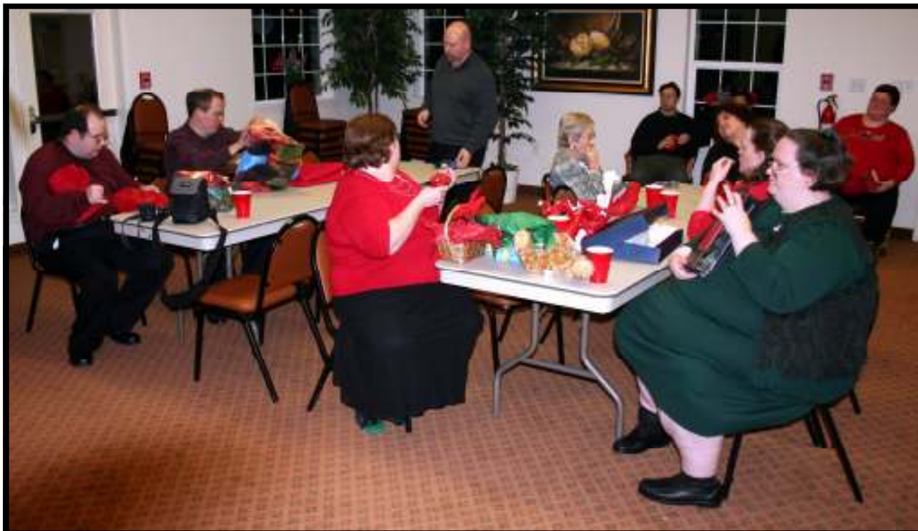
The Niagara crew open gifts received during the evening's gift exchange

Left-over's from the night's festivities were donated to the residents of Montgomery Park, who graciously allow the USS Niagara to hold its meeting and events in their Recreation Room.