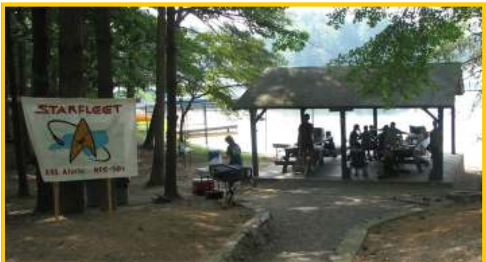
USS Alaric Silver Anniversary Party at Lake Julian Pavilion # 4