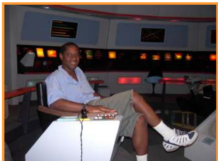
Tim Russ on the set of ST: Of Gods And Men