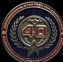
Lapel Pin $7