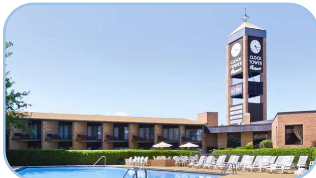
The Clock Tower Resort will host the 2014 STARFLEET International Conference this August in Rockford, Illinois.

Also, as with anything we in STARFLEET do, the Conference Committee is in need of volunteers in order to make