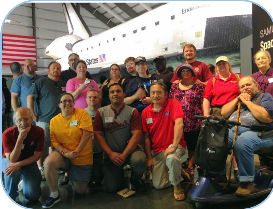
Region 4 Conference participants see the Endeavour at the California Science Center.