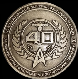
Challenge Coin $10