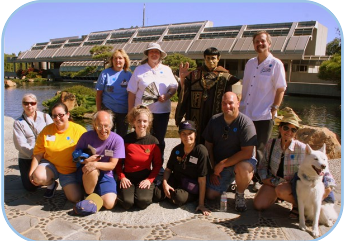
Region 4 Conference participants at the Japanese Garden, the Van Nuys filming site for Starfleet Headquarters and Academy in the "Star Trek" spinoffs.

On the afternoon of October 6, we beamed to the nearby Japanese Garden, aka Starfleet Headquarters and Academy in The Next Generation , Deep