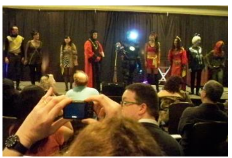
Costume contest finalists line up

There were a lot of other people who spent much time and effort