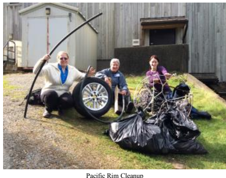
The Haul VR

of litter piled right where the access trail joined the beach. LT Shearwater recovered a broken freight pallet and fishing float. We recovered one hazardous item -- a (thankfully unbroken)