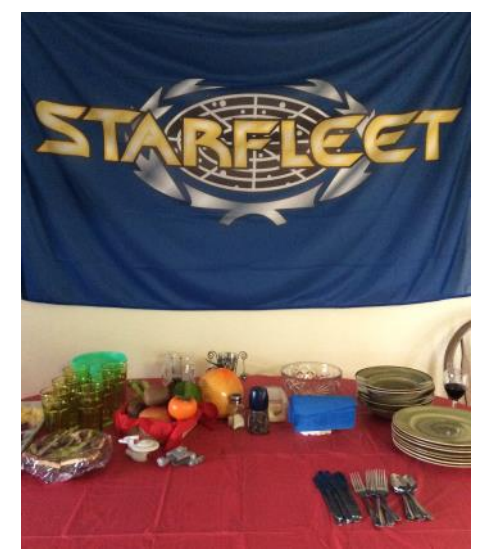
Before the Feast—STARFLEET above all!

Aboard ADSP, Shore Leaves are social events. The host is captain of their home and has the centre seat for the duration of the event. First Contact (this was our third) rapidly became an ADSP tradition. It's adapted from the Japanese tradition of the Shin-nen kai (New Year party), held in January, rather than the Bo-nen kai (Old / "Dead" Year party) held in December. This leaves our members free for their busy family schedules in December, and starts the year fresh when everyone has more time and more energy in their personal warp cores.