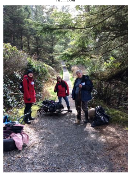
Pacific Rim Cleanup

power is the only way to get debris off these more remote beaches.