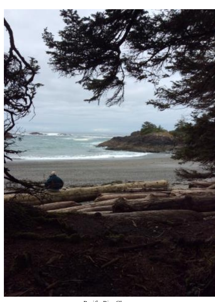
Pacific Rim Cleanup

http://www.pc.gc.ca/eng/pn-np/bc/ pacificrim/index.aspx