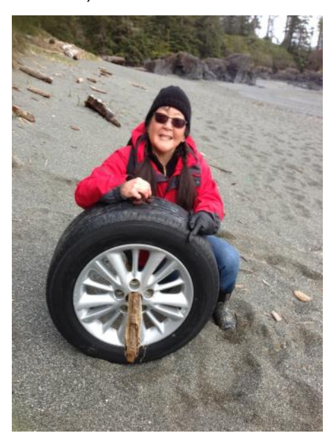
Pacific Rim Cleanup

Weather was perfect! Sunny skies looked down on nearly-deserted beaches. Breezes blew, blue-green Pacific ocean waves rolled onto sand, pebbles, and solid, black rock.