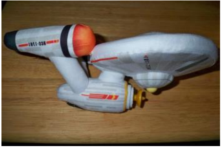
Enterprise plush toy - port view

"It was great fun seeing everyone and having a car-a-van over to